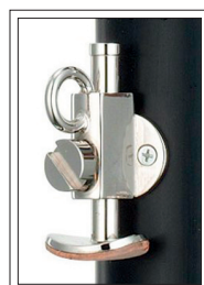
Adjustable thumb-rest with strap-ring